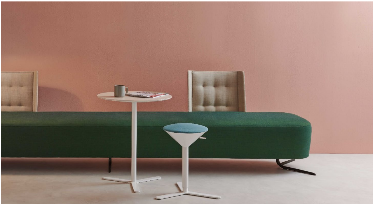
Cono, round coffee table with white snow powder coated structure and ceramic top