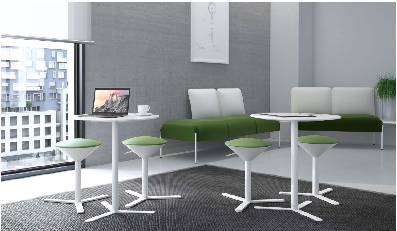
Cono, round coffee table with white snow powder coated structure and fenix laminate top