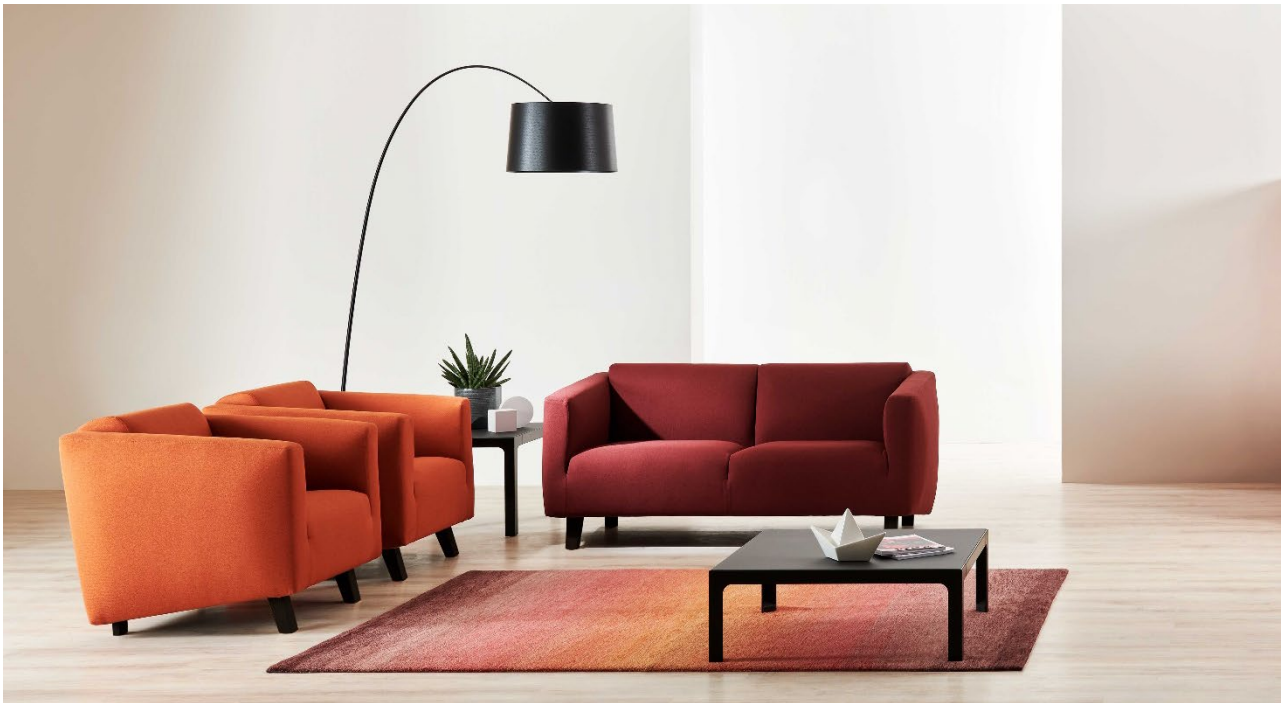
More coffee tables with carbon glacè structure and back lacquered glass top.