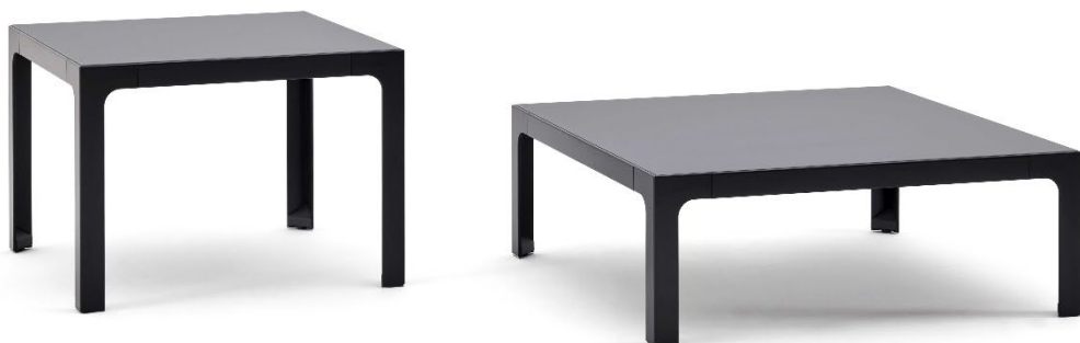
More, 60x60 H45 and 80x80 H50 coffee tables