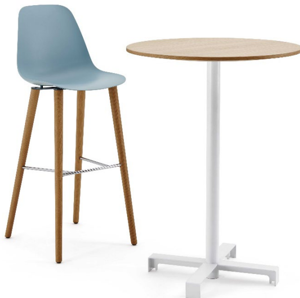
H105 Sanmarino coffee table.