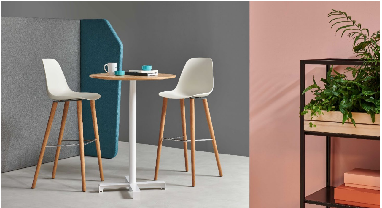
H105 Sanmarino coffee table with natural oak veneer wooden plank and metal white snow powder coated base.