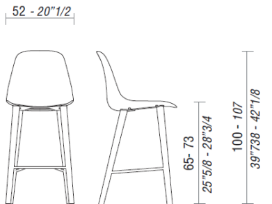
POLA, 4 wooden legs stool.