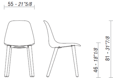
POLA, 4 wooden legs chair.