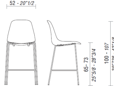
POLA, 4 metal legs stool.