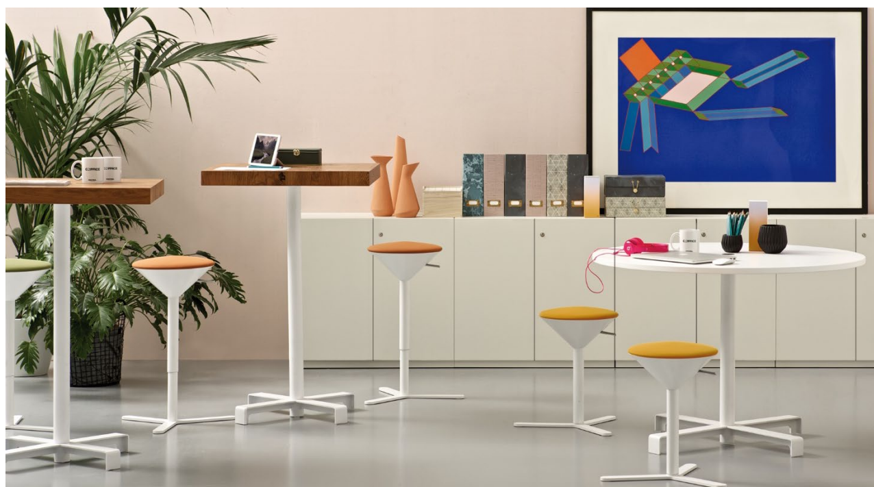
Cono, H45 (17 \frac{3}{4} ") - 65 (25 \frac{5}{8} ") stool with white snow powder coated base