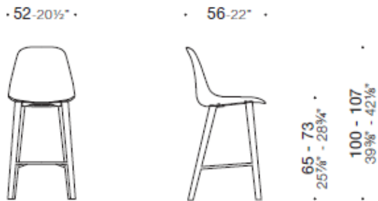
Pola, 4 wooden legs stool