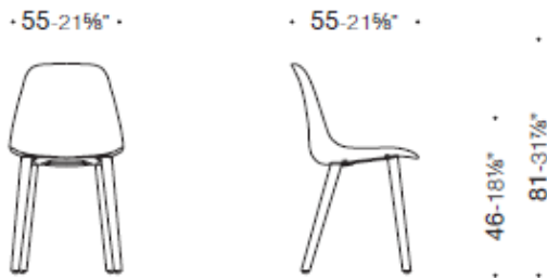
Pola, 4 wooden legs chair