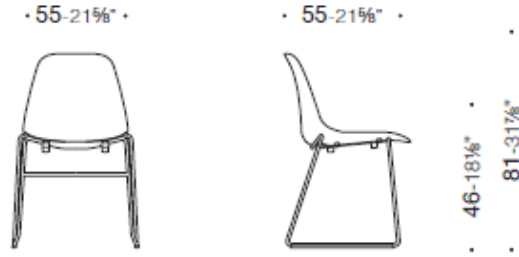
Pola, cantilever chair