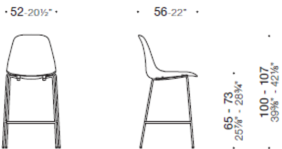
Pola, 4 metal legs stool