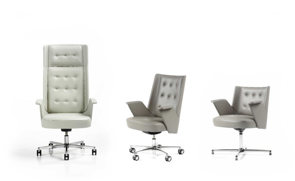
Embrasse Office family.