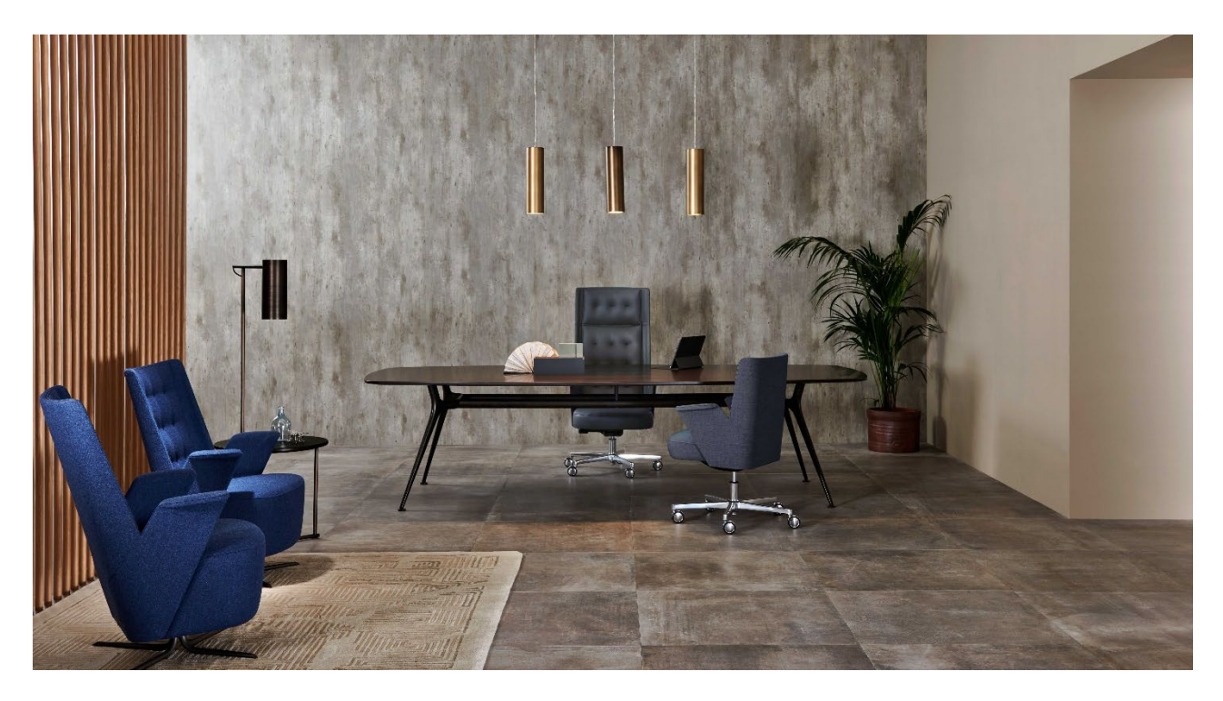
Embrasse Office with high and medium height backrests...