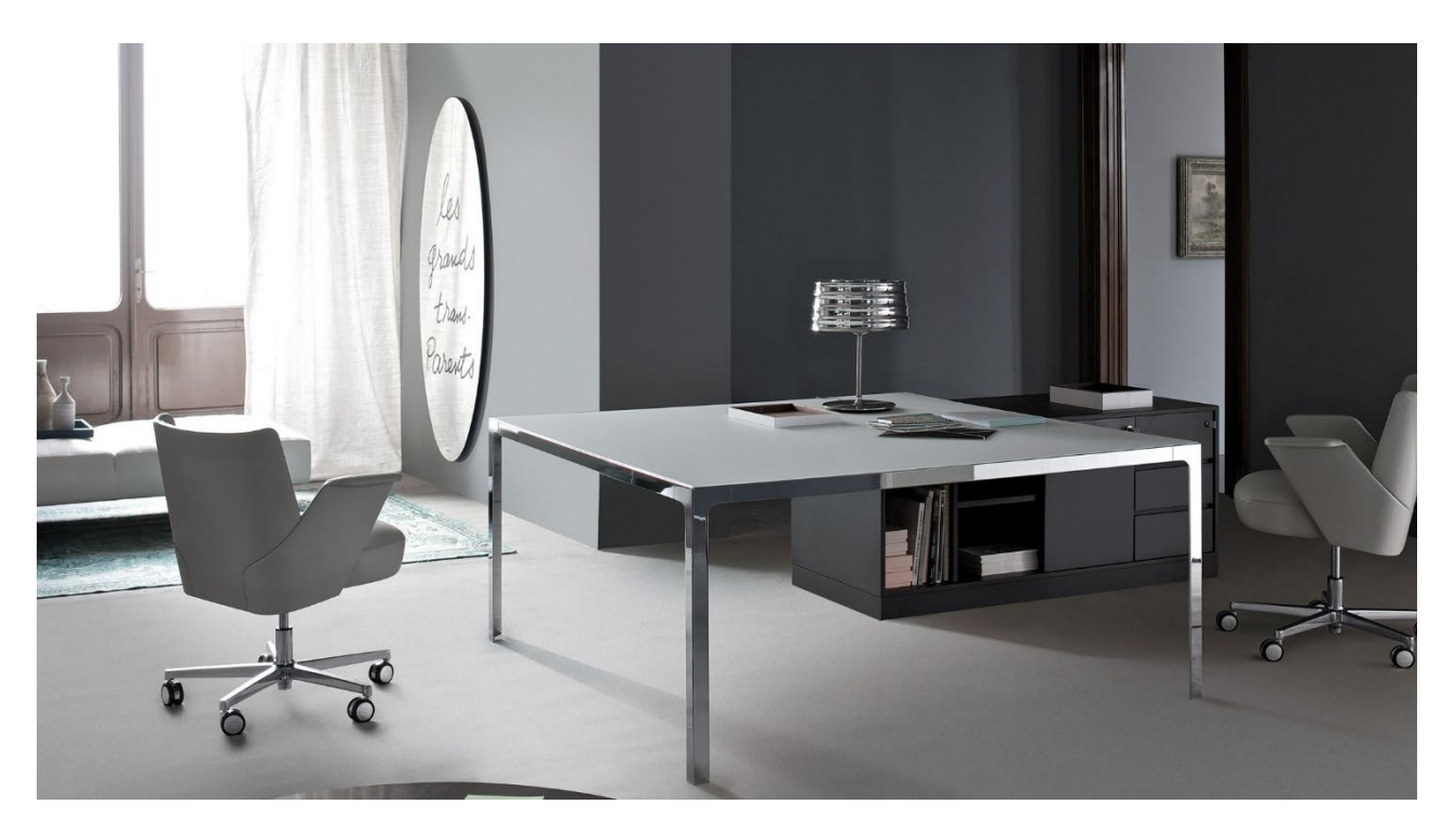
Embrasse Office with medium height backrest..