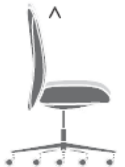
height adjustment - standard