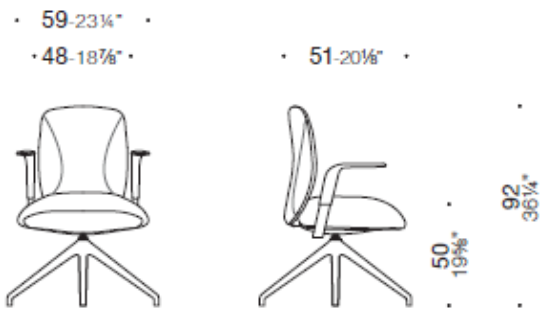
Now, visitor chair with low backrest and armrests