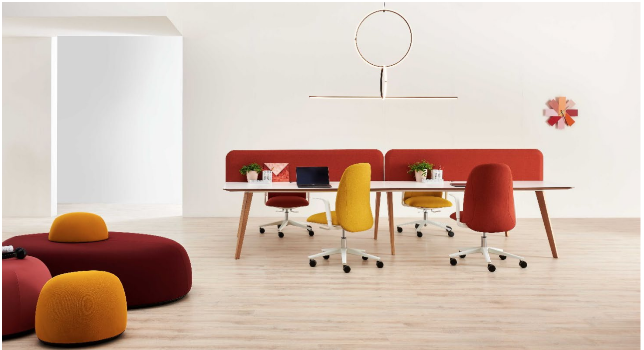
Now, chair with high backrest and armrests