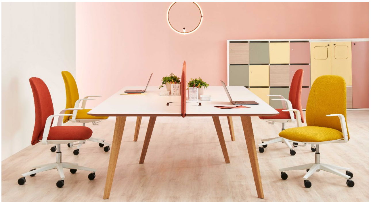
Now, chair with high backrest and armrests