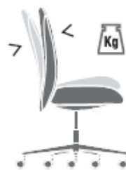
backrest tension adjustment - available