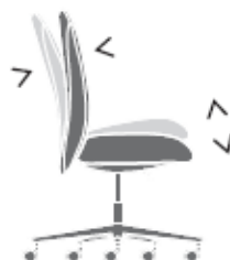
syncro autofit mechanism - available