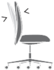
swinging backrests mechanism - standard