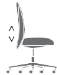
lumbar support adjustment - available