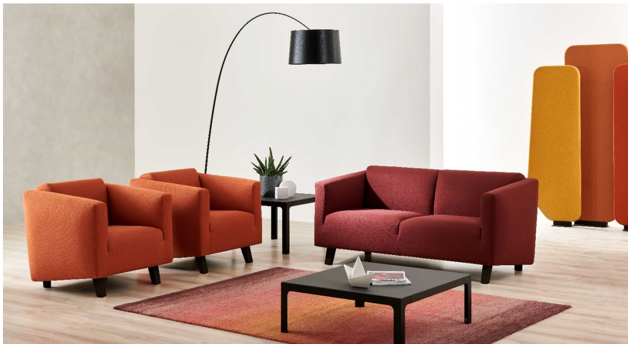
Steve, W166 sofa and armchair