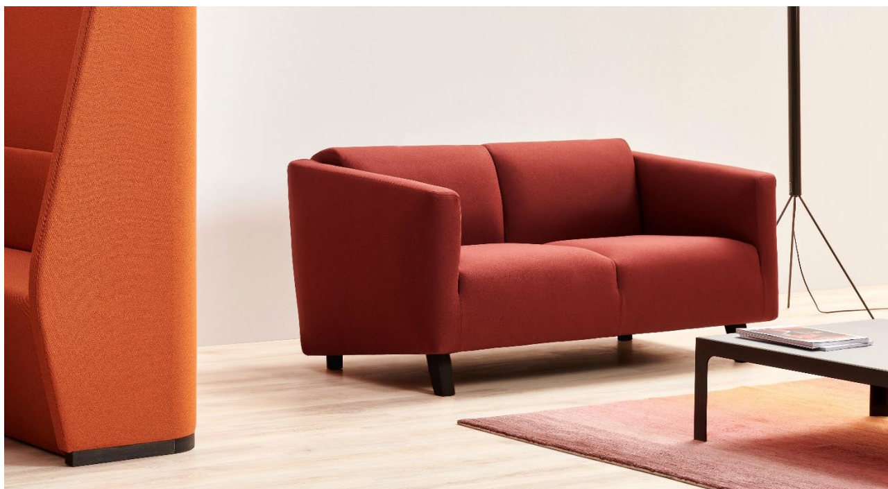
Steve, W166 sofa